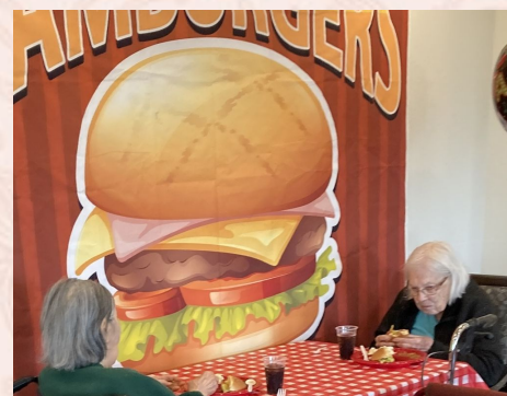
Residents enjoying hamburgers, potato salad, baked beans, watermelon.